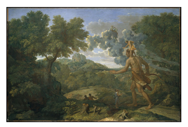
Figure: Cedalion standing on the shoulders of Orion, by Nicolas Poussin 1658

'Dwarves standing on the shoulders of giants,' attributed to 12th century Bernard of Chartres, popularized 1675 by Isaac Netwon.